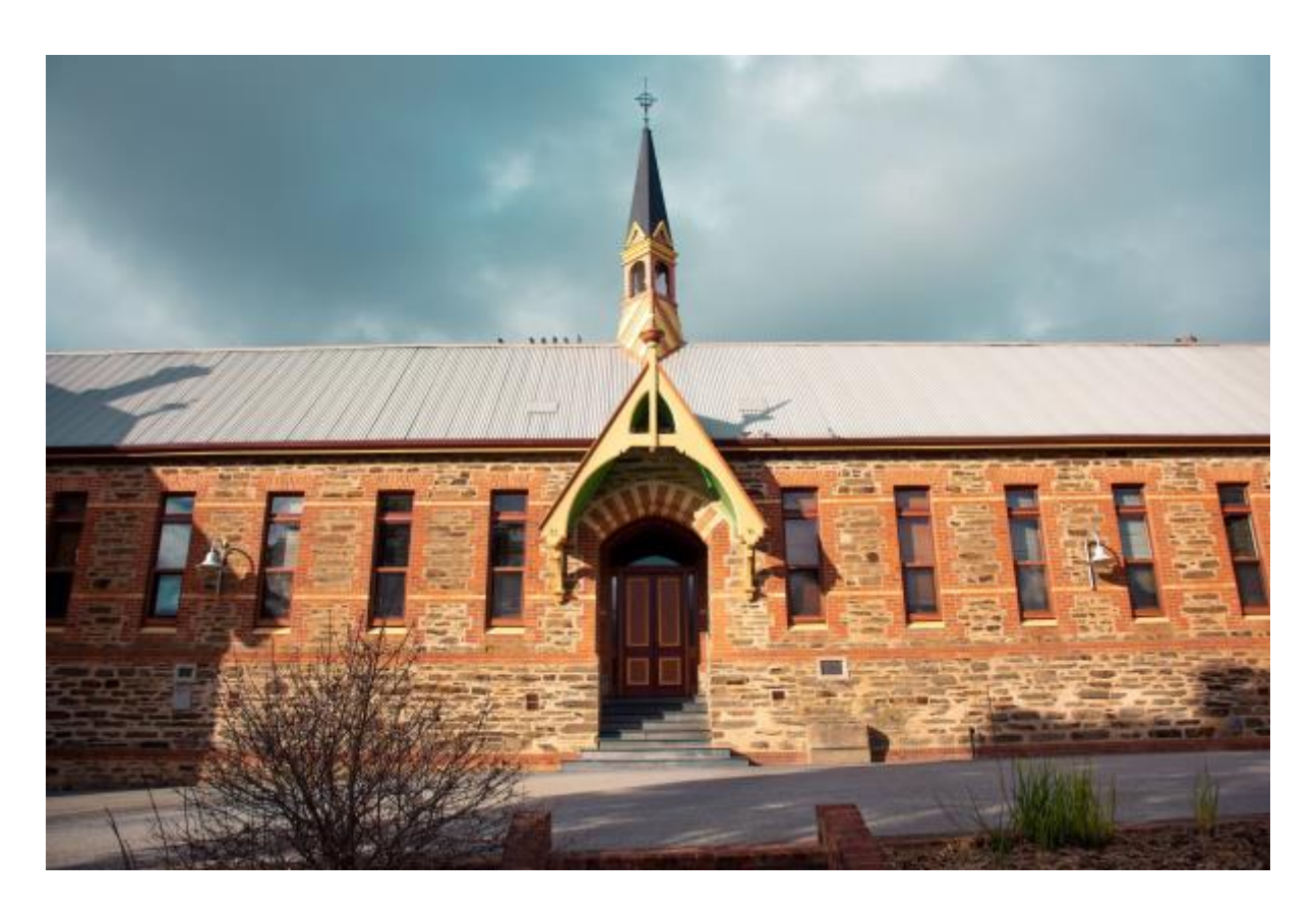
Gawler Primary School Newsletter Week 5

Welcome to our new newsletter format we are trialling for 2022.